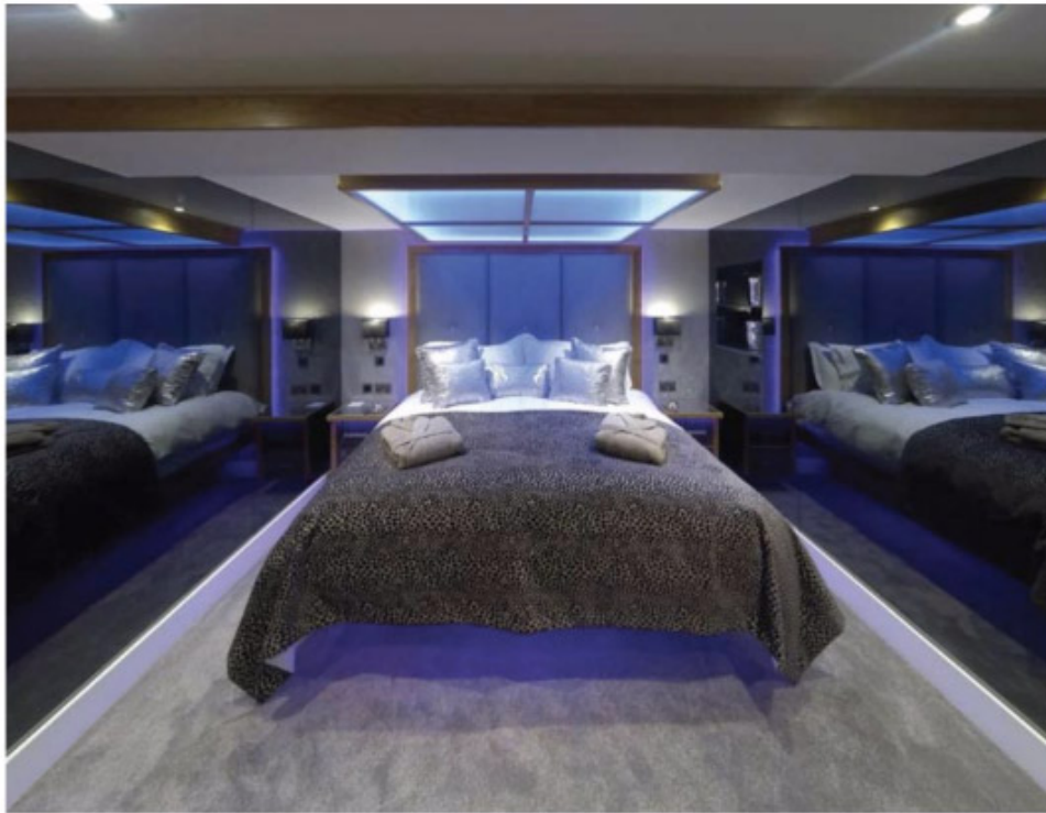
ABOVE: The Boutique Church Suites Submitted by: The Cranleigh

The Boutique Church Suites are a new, unique and completely cutting edge accommodation experience in the Lake District. The Boutique Church Suites are located in Bowness-on-Windermere and housed in a 350 year old building. The design brief was to offer 4 custom made adults-only spaces (The Opulence Suite, The Fantasy Suite, The Utopia Suite and The Indulgence Suite), combining luxury and cutting edge design & technology. Each suite has been individually created. Stylish and original, each offers bespoke, handmade furniture, thick luxurious carpets, crystallized Swarovski padded headboards, infinity mirrored walls, electric black out blinds and a complimentary mini bar, including champagne.