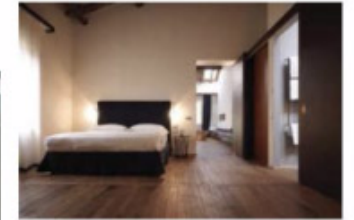
ABOVE: Hotel Mulino Grande Submitted by: Studiotesesi

The Hotel Mulino Grande is the result of the transformation of a Sixteenth Century water Mill within the Agricultural South Park of Milan. The project involves both contemporary design and attention to detail, preserving the charm of history and the vitality of nature.