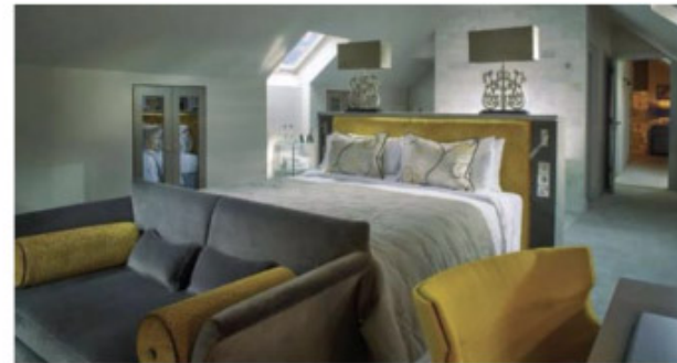
ABOVE: Highbullen Hotel Submitted by: Park Grove

The brief was to develop an outstanding suite with an aesthetic which belies its unusual space. A key aspect of the interior design was to focus attention away from the sloping roof lines onto a glamorous central feature wall. The wall serves as a stylish headboard, topped by large filigree table lamps acting as a screen between the bed and the adjacent open plan bathing area. A velvet sofa features as a footboard, creating a lounge to the other side of the room.